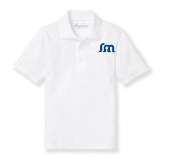
Polo shirt is worn tucked in.

St. Margaret's spirit wear sweatshirts are permitted at the middle school year round.